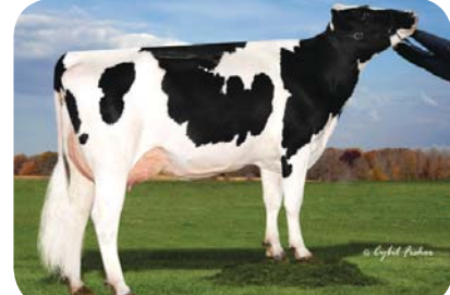
Dam: S-S-I Mont 8679 10726-ET (GP 83)

(Heinz x GP-83 Montrass x VG-89 Supersire)