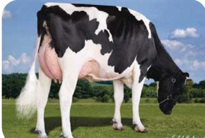
Dam: S-S-I Supsire Miri 8679-ET (VG 89)

(Montrass x VG-89 Supersire x VG-87 Bookem)