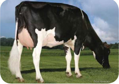
Lars-Acres Bob 16060

NMS: 693 DWPS: 877 Milk: 735 %P: 0.13 Pro: 56 %F: 0.16 Fat: 73 CE: 6.7, Rel 99 PTAT: 1.89 Rel: 95 UDC: 1.80 FLC: 0.91 TPI: 2578