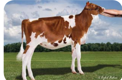
Opsal Diamondback Madison-Red

(Doorman x EX-94 Talent x EX-96 Regiment)