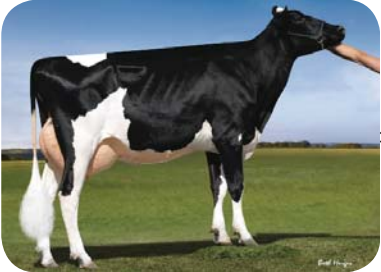
Dam: De-Su Supersire 3349-ET (GP 80)

(Jedi x GP-80 Supersire x VG-87 Man-O-Man)