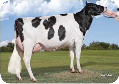
Goff Tetris 49738

(Supersire x GP-81 Domain x VG-87 Planet)