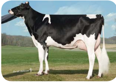
GDam: J-Mor Man-O-Man Honey-ET (VG 88)

NMS: 688 DWPS: 795 Milk: 1505 %P: 0.02 Pro: 50 %F: 0.04 Fat: 67 CE: 6.1, Rel 62 PTAT: 3.04 Rel: 78 UDC: 2.65 FLC: 1.98 TPI: 2612