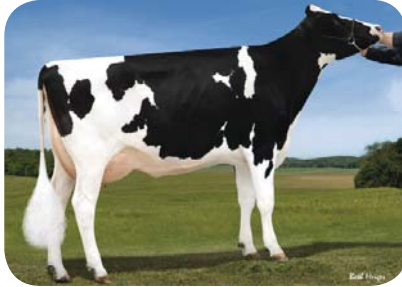
Dam: Sandy-Valley Uno Scarlet-ET (VG 85)

NMS: 737 DWPS: 927 Milk: 1229 %P: 0.04 Pro: 50 %F: 0.10 Fat: 71 CE: 7.0, Rel 98 PTAT: 2.36 Rel: 79 UDC: 2.15 FLC: 1.19 TPI: 2658