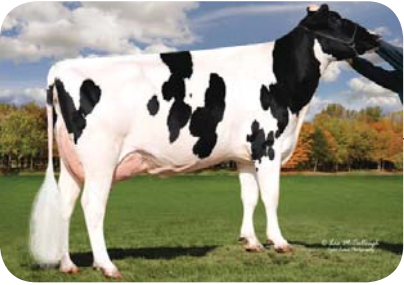
Dam: Hurtgenlea Supersire Malibu (VG 85)

(Yoder x VG-85 Supersire x EX-90 Russell)